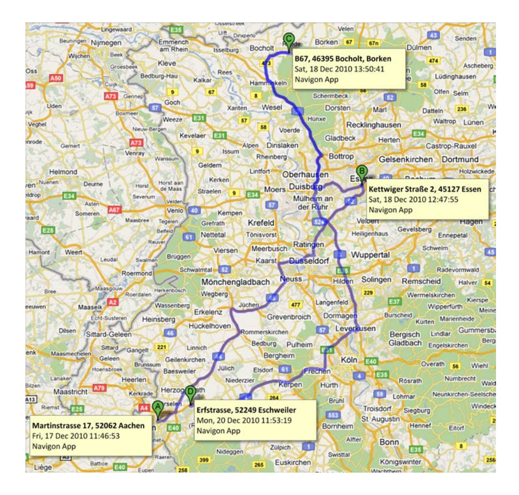
Fig. 5. Graphical presentation of textual geodata

From this presentation format an investigator can quickly identify, at which different locations the phone (user) has been at certain points in time. The routes also give indications on the movements of the user, which can be correlated to other evidence of the particular case.