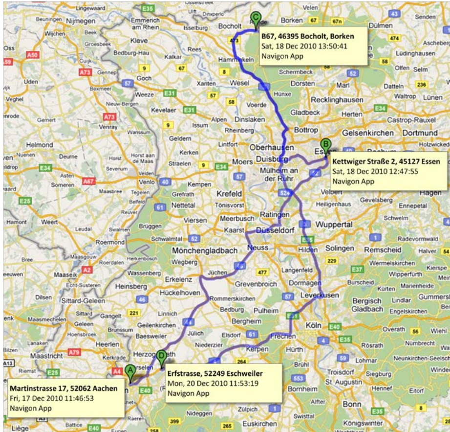
Fig. 5. Graphical presentation of textual geodata

From this presentation format an investigator can quickly identify, at which different locations the phone (user) has been at certain points in time. The routes also give indications on the movements of the user, which can be correlated to other evidence of the particular case.