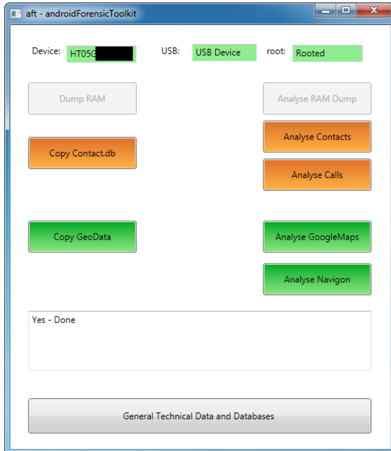
Fig. 6. Android Forensic Toolkit (Status Feb 2011)

The extraction, conversion and presentation modules are work in progress. The geodata presented in the context of this paper has been manually extracted from the acquired data and semi-automatically processed further.